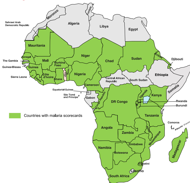
Figure 2 - Countries with National Malaria Scorecards

health-sector and malaria-specific review mechanisms. The simplicity of the scorecard enables political and technical stakeholders to have a more effective conversation, facilitating multi-sectoral action and accountability. When an indicator is red, or performance declines, this is a call to action for stakeholders to take action to drive improved performance. Additionally, because scorecards show performance at national and subnational level, they can be used to identify areas that require additional resourcing to address service delivery bottlenecks. This has resulted in the enhanced allocation of both domestic and donor resources to fund interventions with key gaps as well as policy change, training and mentoring, and social mobilisation. Enhancing the access and sharing of these scorecards improves community engagement at all levels.